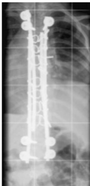
Figure 4. Growth Guidance Technique – Modified Luque Trolley

the construct are spread evenly by placing the wires at almost every level across the instrumented area. The abiding principle here is that as the spine grows the rods act as a guide while maintaining the correction to the scoliosis. There are conflicting reports about the early results of this treatment, but recent modifications to the system appear to have improved outcomes. It was initially felt that implantation over such a wide area of the spine in young children might lead to premature fusion of the spine but this does not appear to always be the case.