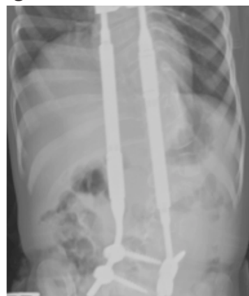
Figure 3. Magnetic Expansion Control System (MAGEC)

is felt this practice improves the quality of life of children with EOS and their families. Repeated hospital visits and time off school and work can be avoided in appropriately selected cases. The rods are lengthened periodically, in the outpatients department, to keep up with growth. In the past this process had to be done in theatre under general anaesthesia every 6 months. Despite the obvious advantages of this technology there are still problems that can occur as with other growing rod devices. These can result in unplanned returns to theatre. They are also expensive but in cases for whom the rods work well there are cost savings for the health service. On average they last 2-3 years before needing replacement and when compared with previous treatments this time represents a substantial decrease in the number of operations a child undergoes.