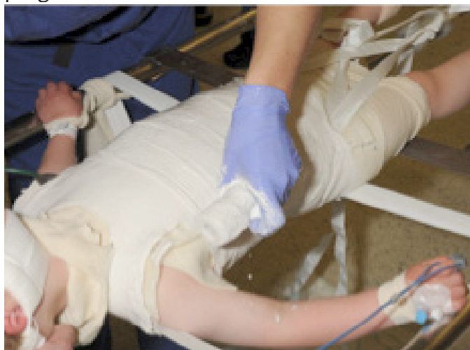
Figure 2. Application of jacket

started after a period of serial casting or on presentation in the older child usually from about 3 years onwards. There are different types of braces. Their actions may be passive or active, or even both. They are made of plastic and do not require a general anaesthetic to be fitted. They are worn until skeletal maturity or when there is evidence that the curve is stable and unlikely to progress.